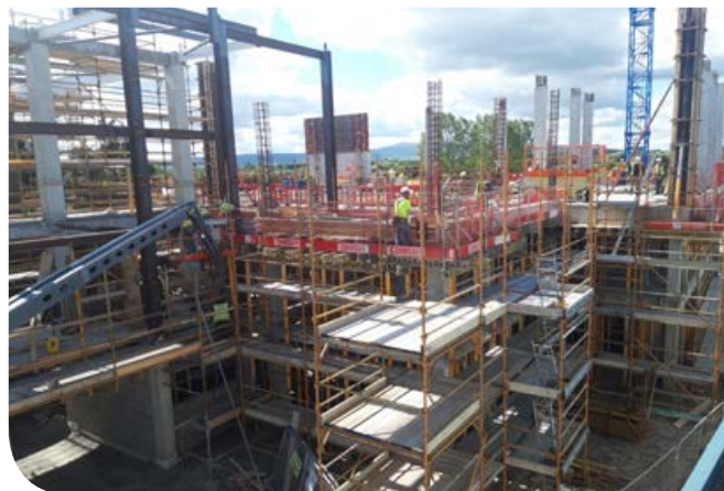
New Casein Plant under construction

This growth in output has necessitated a major reinvestment in our milk processing facility in Nenagh. We have commenced late in 2018 the construction of a new Casein plant.