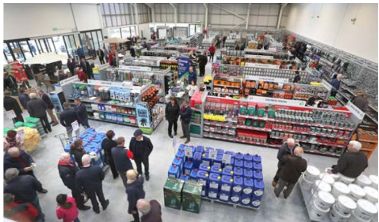
Newly built Agri Retail Store Athenry